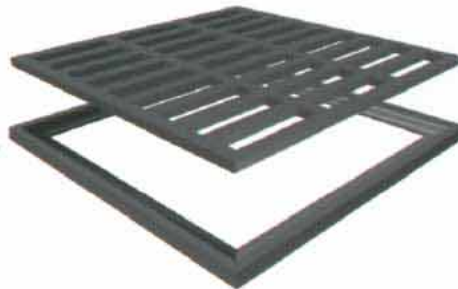
Square or Rectangular Grates & Frames