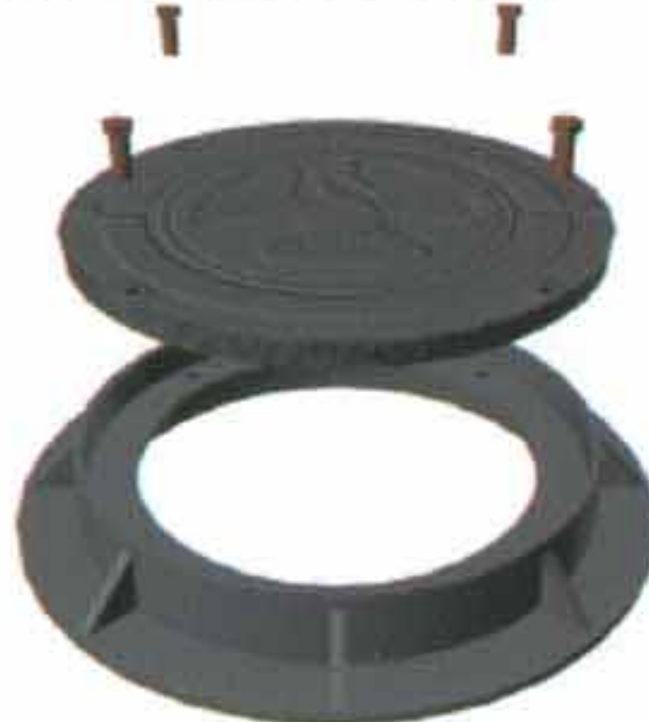
Water-tight Rings & Covers