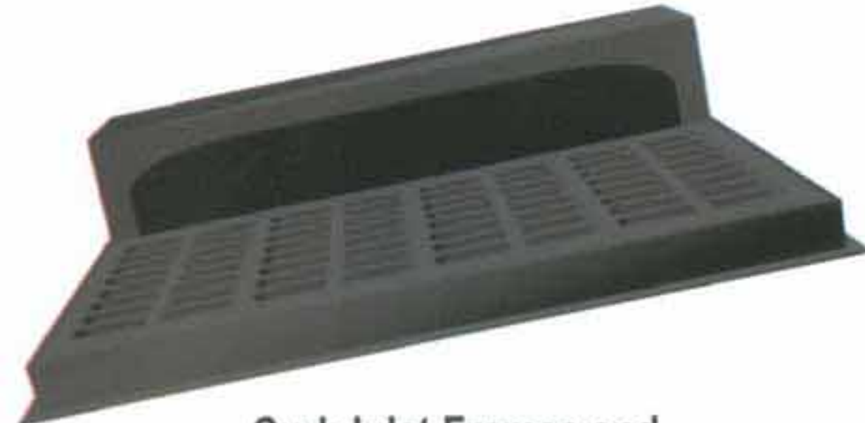
Curb Inlet Frames and Grates with Curbpiece

(Class 30 or Class 35 Gray Iron or Ductile Iron)