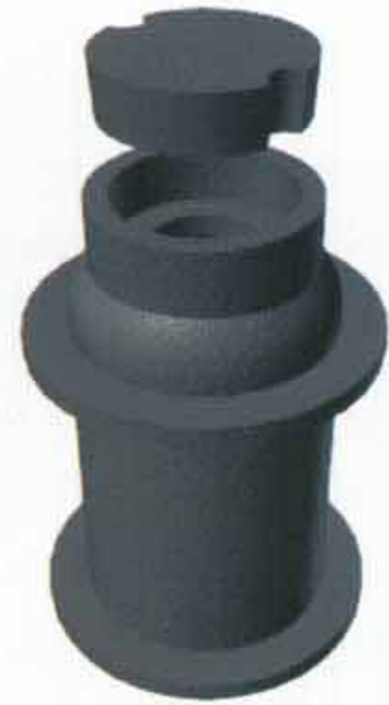
Fixed Length Valve Boxes