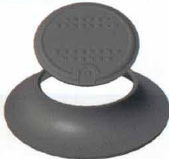
Drop Inlet Meter Boxes