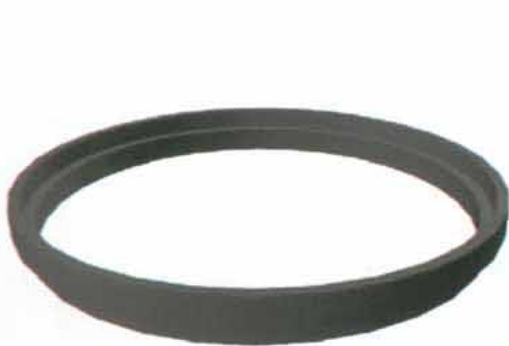
Manhole Extension Rings (1" - 6" Rise)