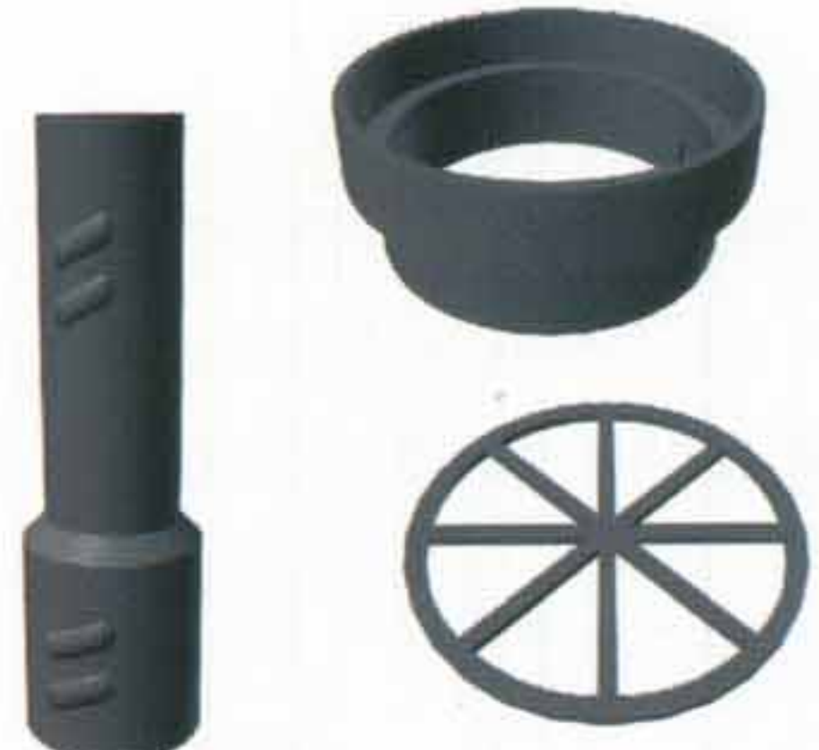
Valve Box Risers and Extensions