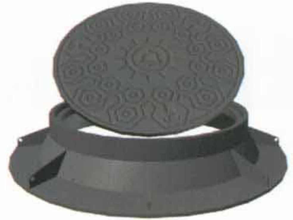
Special Design Rings & Covers