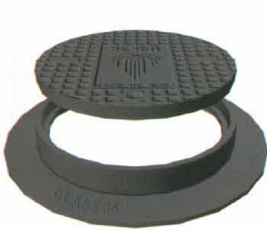
Standard Design Rings & Covers

(Class 30 or Class 35 Gray Iron or Ductile Iron)