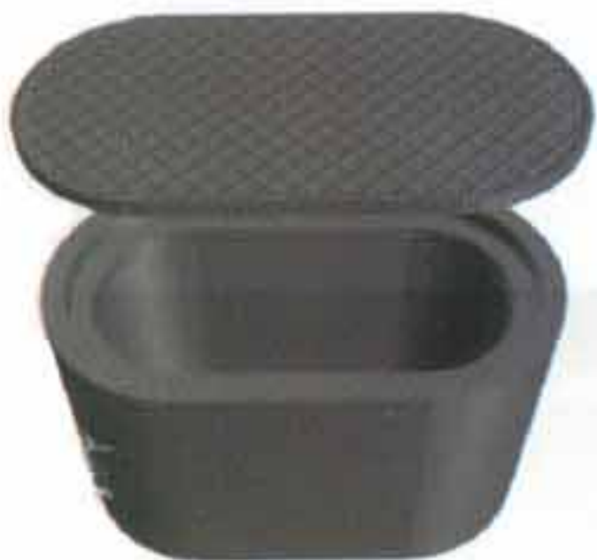
Cast Iron Meter Boxes