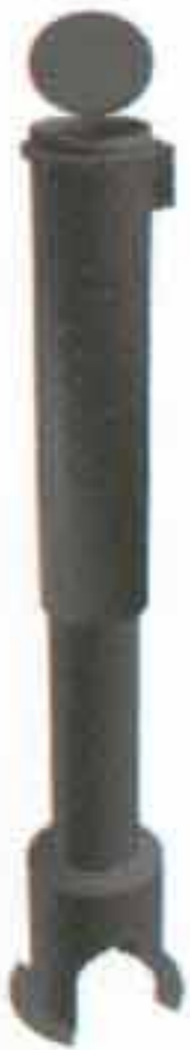
Cast Iron Service Boxes and Accessories