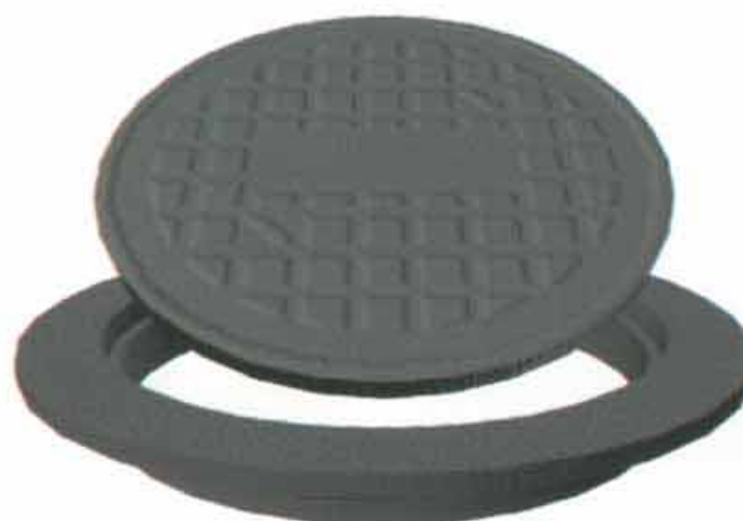
Storm Inlet Rings & Covers