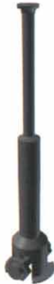
Assembled Curb Boxes Arch or Threaded Type