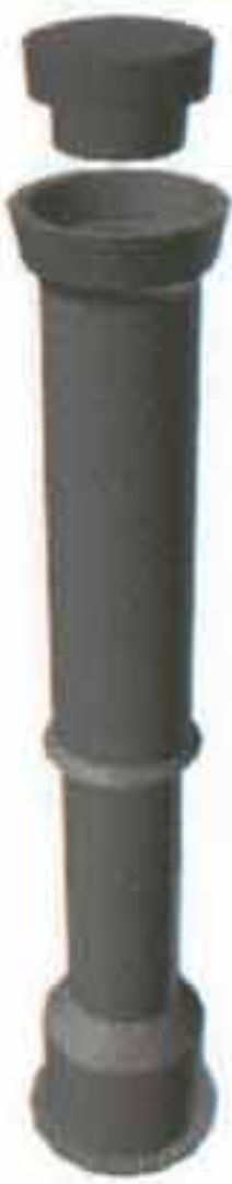
2-Piece and 3-Piece Adjustable Valve Boxes