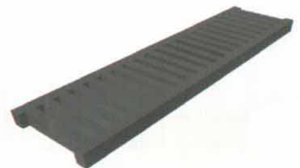
Trench Grates (Ductile or Gray Iron)

We can also produce to your special requirements !